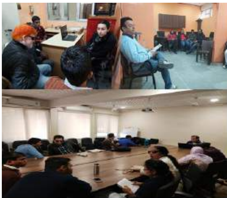
Soft Skill Classes

The Unit has various Training modules to cater to the needs of different categories of educated blind persons for constantly maintain high standards. This has had revolutionary changes like disciplines of education for blind persons and increases the employability and social responsibility. Now started a new course i.e. CCE with our sponsors NAB, Hauz Khas to develop the employability of blind persons.