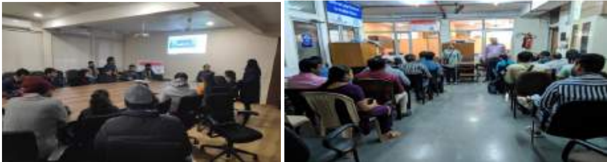
Android Accessibility Workshop