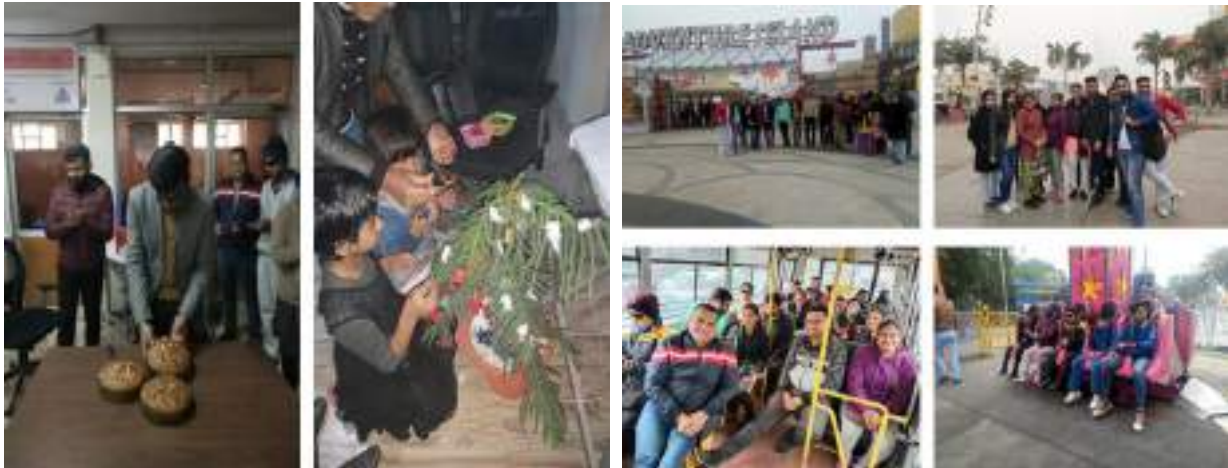
Picnic to Adventure Island and Christmas Celebration

Goodyear -Road Safety: Road Safety and Mobility Training Program Supported by Goodyear South Asia Tyres Pvt. Ltd.